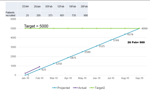
Global Enrolment : By Country (Target vs Actual Recruitment Cohort 1 and 2)